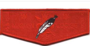
[ ]S27 2000 | (OA BBV6: S27)