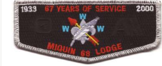
[ ]S29 2000 | (OA BBV6: S29)