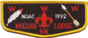
[ ]S16 1992 | (OA BBV6: S16)