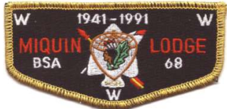
[ ]S15 1992 | (OA BBV6: S15)