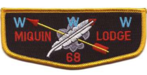
[ ]S20 1994 | (OA BBV6: S20)