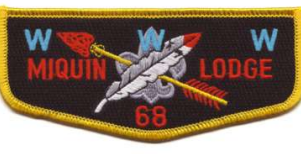
[ ]S24a 1998 | (OA BBV6: S24)