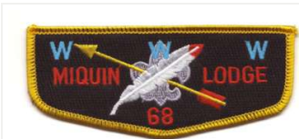
[ ]S14 1991 | (OA BBV6: S14)