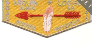
[ ]S21 1996 | (OA BBV6: S21)