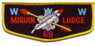
[ ]S24b 1998 | (OA BBV6: )