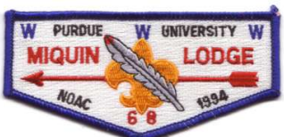
[ ]S19 1994 | (OA BBV6: S19)