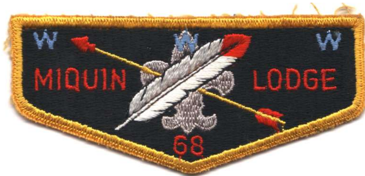
Miquin S1 1958