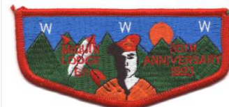
[ ]S18 1993 | (OA BBV6: S18)