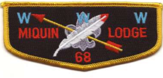
[ ]S17 1992 | (OA BBV6: S17B)