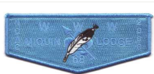
[ ]S28 2000 | (OA BBV6: S28)