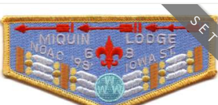
[ ]S26 1998 | (OA BBV6: S26)