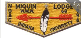
[ ]S22 1996 | (OA BBV6: S22)