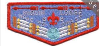
[ ]S25 1998 | (OA BBV6: S25)