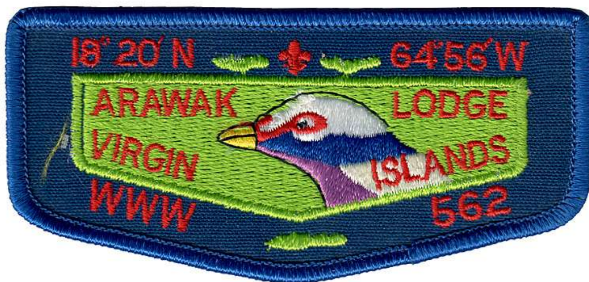
Arawak F7b 1990'S