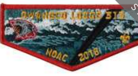
[ ] S69 2018