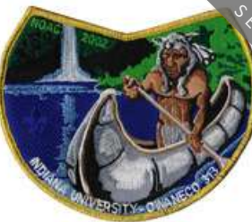
[ ] X5 2002 | (OA BBV6:)