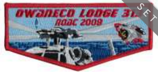
[ ] S36 2009