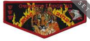
[ ] S48 2012