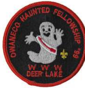
[ ] eR1999-1 1999 | (OA BBV6: )