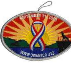
[ ] X3 2001 | (OA BBV6:)