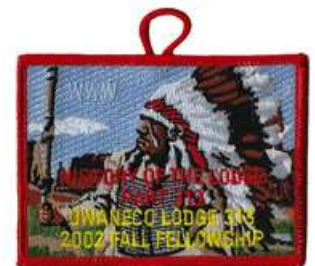
[ ] eX2002-1 2002 | (OA BBV6: )