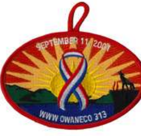
[ ] X2 2001 | (OA BBV6:)