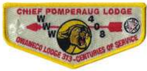
[ ] S59 2015