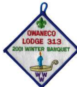
[ ] eX2001-3 2001 | (OA BBV6: )