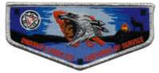
[ ] S56 2015