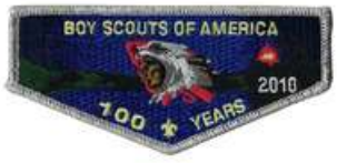
[ ] S39 2010