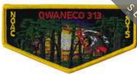
[ ] S63 2015