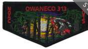
[ ] S64 2015