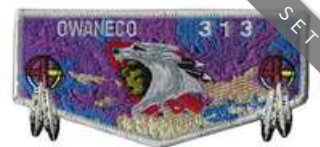
[ ] S38 2009