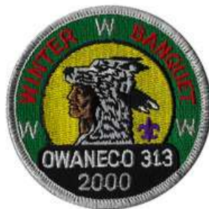
[ ] eR2000-1