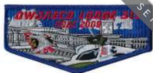
[ ] S37 2009