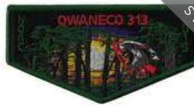
[ ] S65 2015