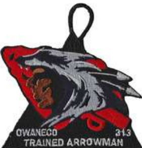
[ ] X6 2002 | (OA BBV6:)