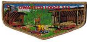
[ ] S43 2011