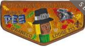
[ ] S67 2017