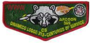
[ ] S57 2015