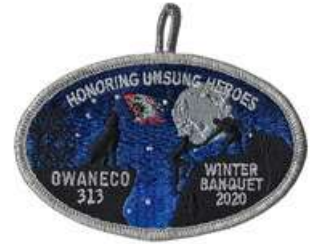
[ ] eX2020-1 2020