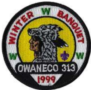
[ ] eR1999-3 1999 | (OA BBV6: )