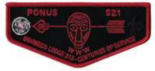
[ ] S60 2015