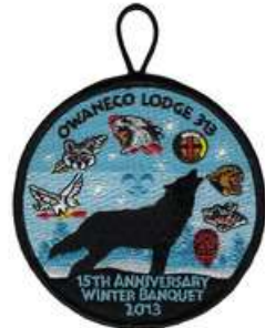
[ ] eR2013-3 2013