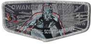
[ ] S51 2013