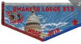
[ ] S70 2018