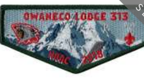
[ ] S68 2018