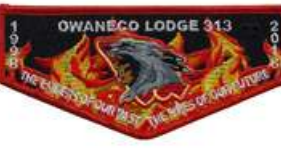
[ ] S71 2018