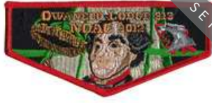
[ ] S47 2012