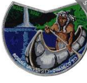
[ ] X4 2002 | (OA BBV6:)