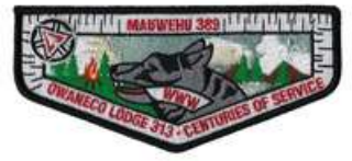
[ ] S62 2015