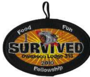
[ ] eX2010-2