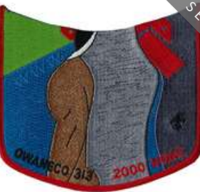
[ ] X1 2000 | (OA BBV6:)