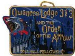
[ ] eX2012-3 2012