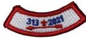
[ ] eX2021-2