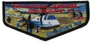
[ ] S41 2010