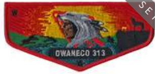
[ ] S45 2012