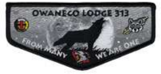
[ ] S52 2013