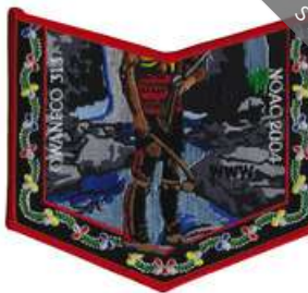
[ ] X8 2004 | (OA BBV6:)