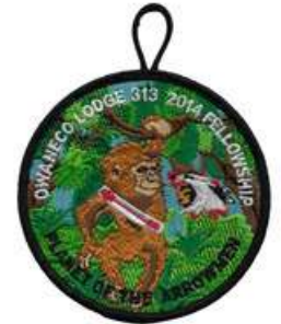
[ ] eR2014-2 2014