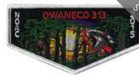
[ ] S66 2015