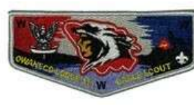
[ ] S72 2022