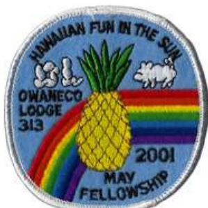
[ ] eX2001-1 2001 | (OA BBV6: )