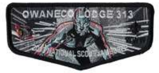
[ ] S50 2013