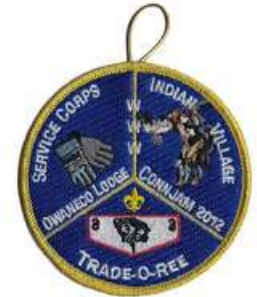
[ ] eR2012-1 2012