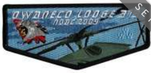
[ ] S35 2009