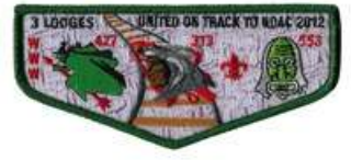
[ ] S46 2012