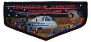
[ ] S42 2010