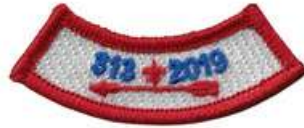
[ ] eX2019-2 2019