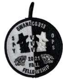
[ ] eR2021-3