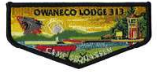
[ ] S54 2014