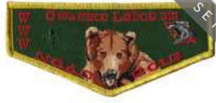
[ ] S49 2012