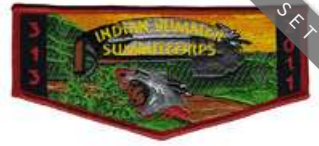
[ ] S44 2011