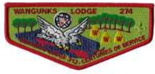
[ ] S61 2015