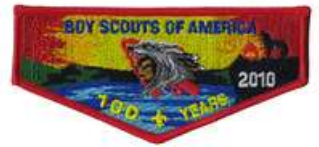
[ ] S40 2010