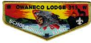
[ ] S53 2013