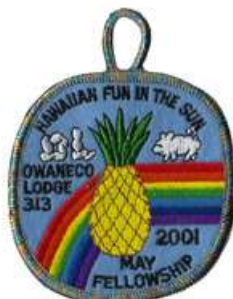
[ ] eX2001-2 2001 | (OA BBV6: )