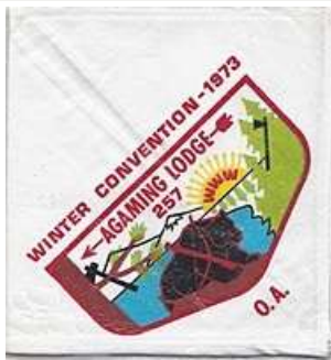
[ ] eN1973 1973 | (OA BBV6: EN1973)