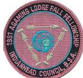
[ ] eR1991 1991 | (OA BBV6: )