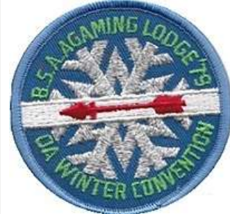
[ ] eR1979 1979 | (OA BBV6: )