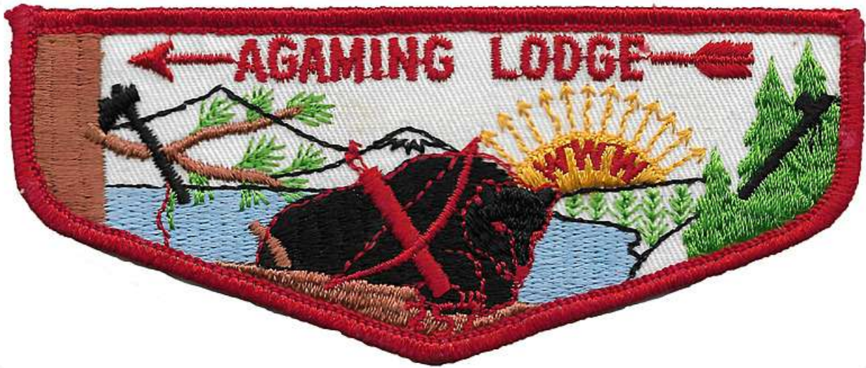
Agaming F1 1953

GENERATED 01 JUL 2022. FOR THE MOST UP-TO-DATE LISTINGS, CHECK OUT WWW.PATCHVAULT.ORG