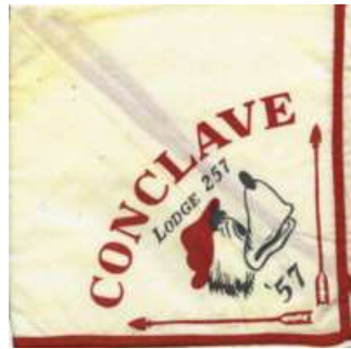
[ ] eN1957-2a