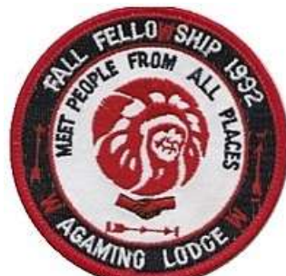
[ ] eR1992 1992 | (OA BBV6: )