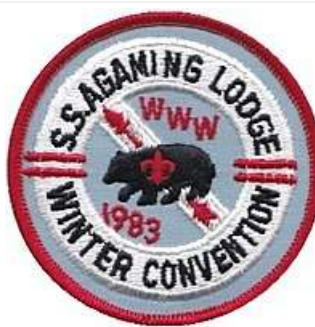
[ ] eR1983 1983 | (OA BBV6: )