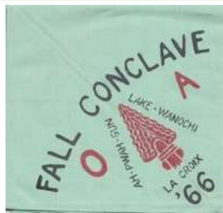
[ ] eN1966 1966 | (OA BBV6: EN1966)