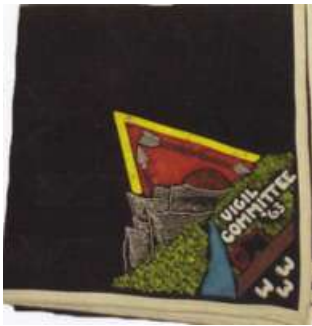
[ ] N2.2