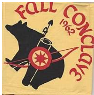
[ ] eN1962 1962 | (OA BBV6: EN1962)