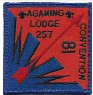
[ ] eX1981 1981 | (OA BBV6: )