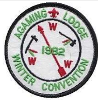
[ ] eR1982 1982 | (OA BBV6: )