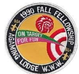
[ ] eR1990 1990 | (OA BBV6: )