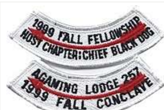
[ ] eX1999 1999 | (OA BBV6: )