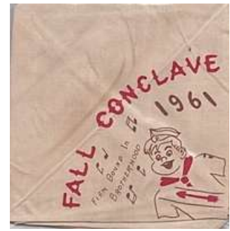
[ ] eN1961 1961 | (OA BBV6: EN1961)