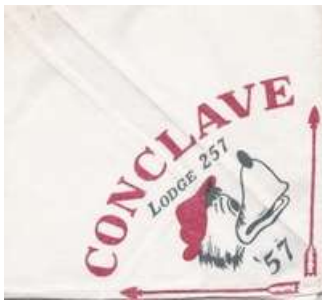
[ ] eN1957-2b