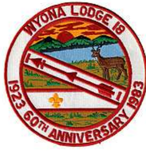
[ ] J2 1983 | (OA BBV6: J2)