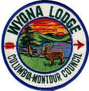
[ ] J1 1970 | (OA BBV6: J1)