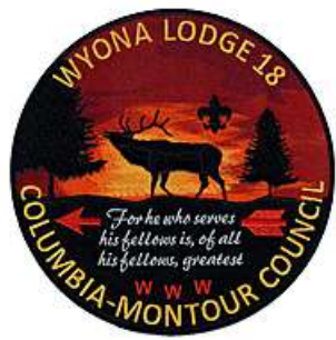
[ ] J5 2016