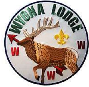
[ ] J4 2006 | (OA BBV6: )