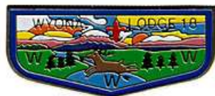
[ ] PIN1 1988