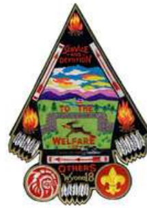
[ ] J3 1996 | (OA BBV6: J3)