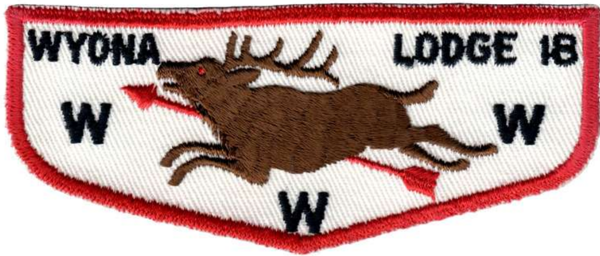
Wyona F1 1957