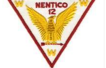
[ ] X3d 1958 | (OA BBV6: X3D)