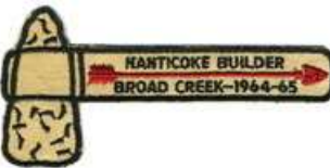
[ ] X4 1964 | (OA BBV6: X4)