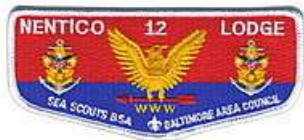
[ ] S47 2019