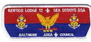
[ ] S48 2019