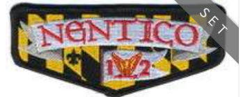
[ ] S50 2020