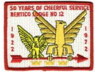
[ ] X6 1972 | (OA BBV6: X6)