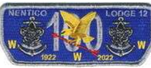
[ ] S55 2022