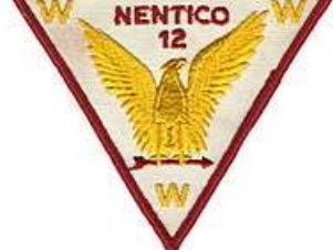
[ ] X2 1950 | (OA BBV6: X2)