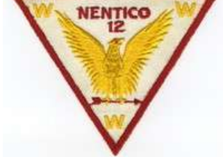
[ ] X3a 1950's | (OA BBV6: X3A, B, C)