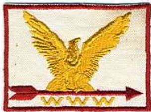
[ ] X1 1948 | (OA BBV6: X1)