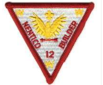
[ ] X7 1981 | (OA BBV6: X7)