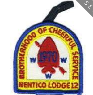
[ ] X5 1970 | (OA BBV6: X5)