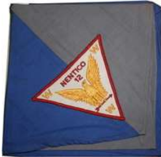
[ ] N0.5